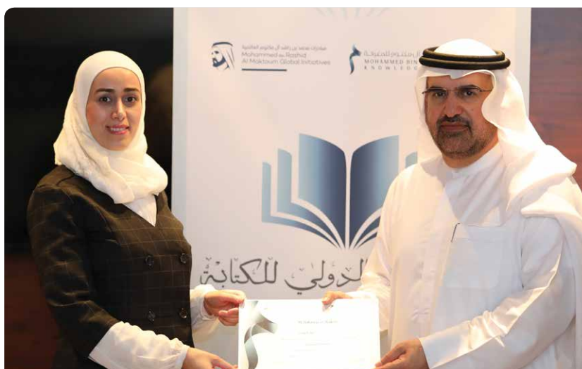
Above: Jamal bin Huwaireb honors participants